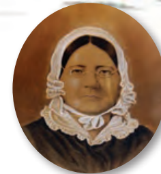
Mary Young Pickersgill, 1776 – 1857