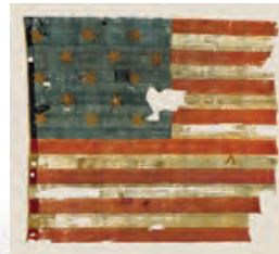
The Star-Spangled Banner. Flag can be viewed at the National Museum of American History. americanhistory.si.edu