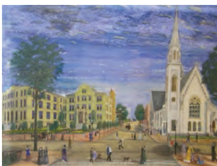
From the Cover: A painting by an unknown artist depicting the intersection of Lexington and Calhoun Streets, off Franklin Square, in West Baltimore prior to 1928. The two buildings to the left are the Aged Women's Home and the Aged Men's Home. The Aged Women's and Aged Men's Homes were acquired by the City of Baltimore in 1959, and relocated to Chestnut Avenue in Towson to become the present day Pickersgill Retirement Community.

independence and assistance. We take pride in our blend of traditional values with contemporary living. We provide a comfortable home and high-quality care at a reasonable cost, and promote each resident's vitality of spirit.