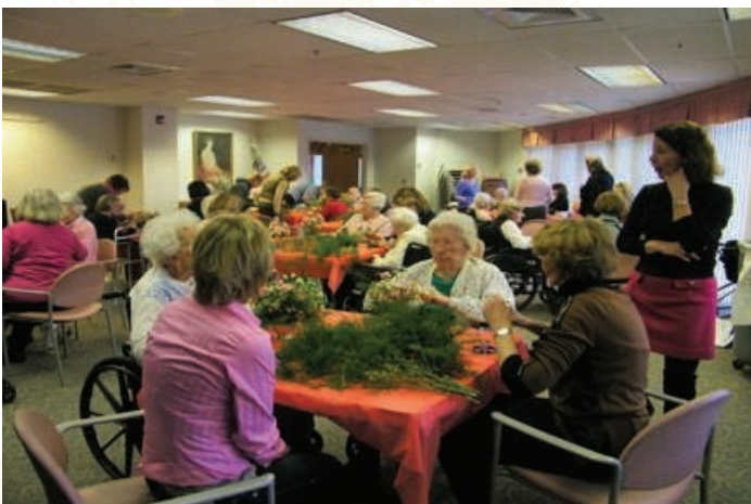
Garden Club Members and Residents Sorting Greens for Centerpieces