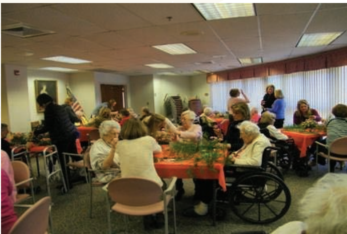
Residents Making Centerpieces