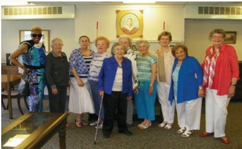
Spring 2015 Models

Residents and staff modeled the latest fashions by TaylorMarie.